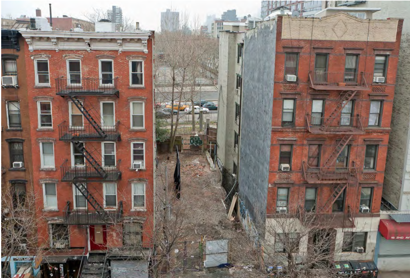
First Park | Houston at 2nd Avenue A New York City Parks property